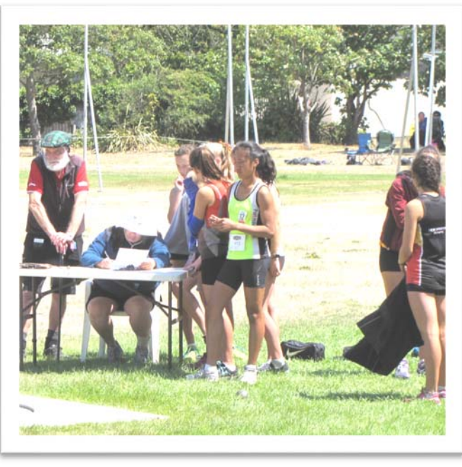
A group of 'young ones' await their turn to throw with us.