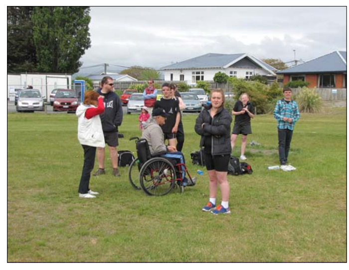
Some of the ParaFed athletes watch on.