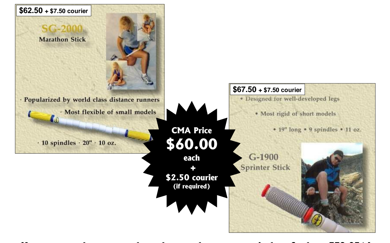
If you want to know more about these products, contact Andrew Stark on 338 0516