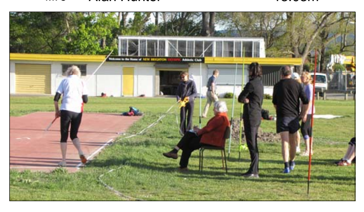
Our throwers prepare for the javelin.