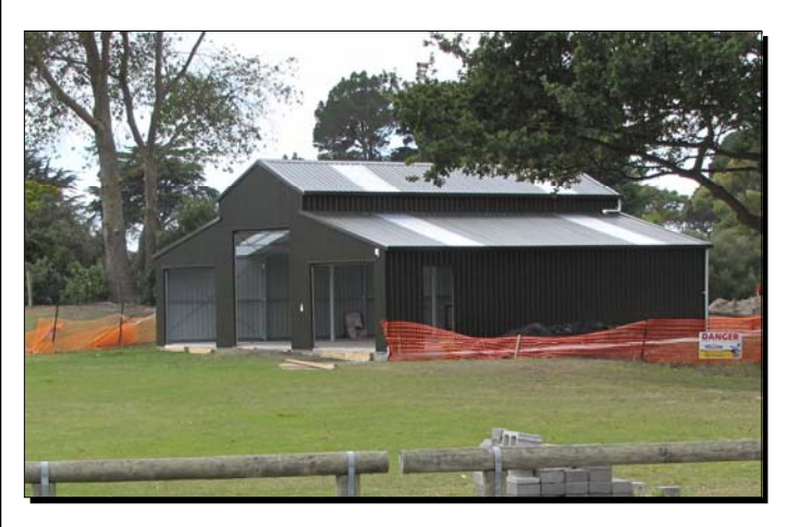
New equipment shed at Rawhiti Domain takes shape.